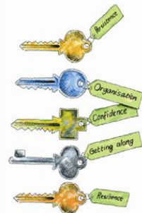
The Keys to Success and Happiness

I am very proud at how all students have managed the settling in period. They have been good examples of the 5 Keys to Success: Persistence, Organisation, Confidence, Getting along and Resilience.